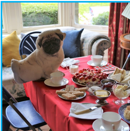
'Shoes? What shoes? I don't know what you are talking about...