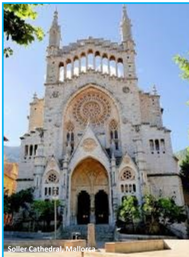
Soller Cathedral, Mallorca