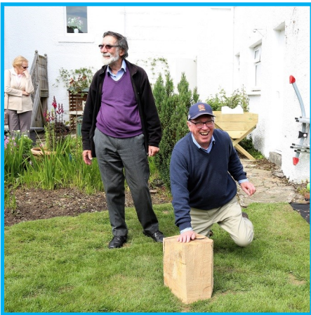
This is the bit before George puts his neck on the block a la King Charles I...