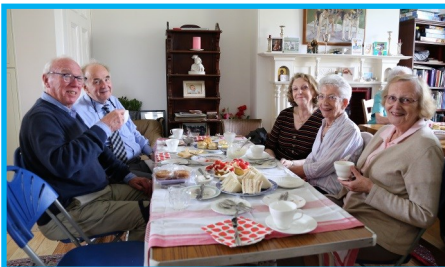
King Charles—head reinstated, joins the rest of the assembled and endeavours to consume the remainder of the cakes and sandwiches but an army would have been required to complete the task...