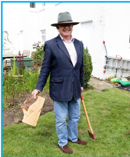
'..drat!...I missed! ..' quoth the executioner with his natty footwear (now cleaned)